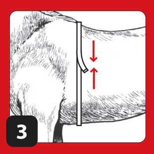
Snug up the tape