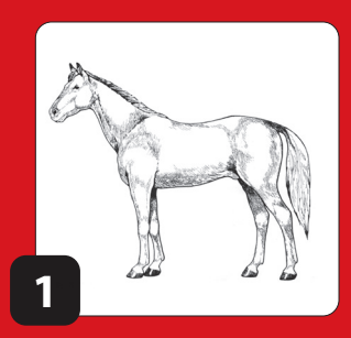
Stand horse square