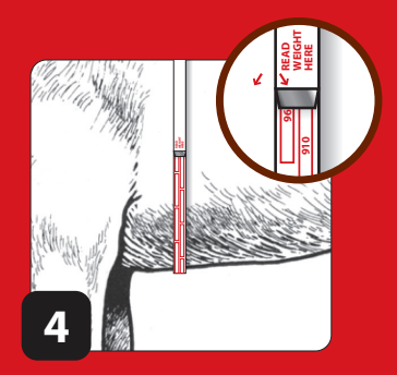
Read the number to get the weight